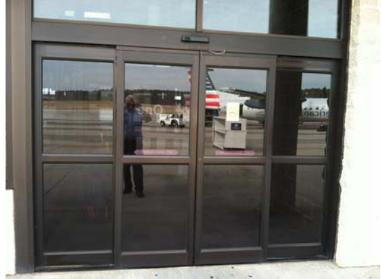
Gate 1 Exterior