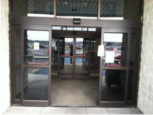
Center Lobby Exterior Door