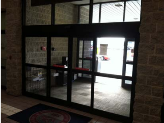
Center Lobby Interior